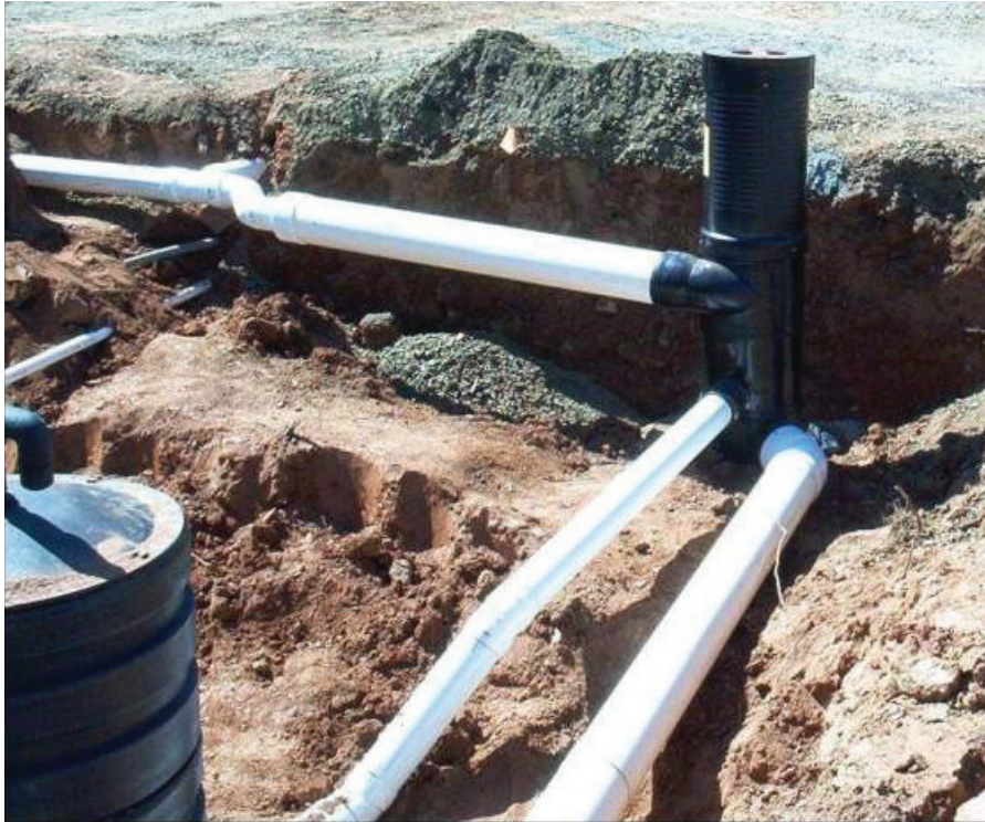
Figure G.2-2. A vortex filter is an example of a pretreatment device for rainwater harvesting. The vortex filter diverts the first amount of rainfall, which tends to have a lot of solids and vegetative debris. Vortex filters come in different sizes based on efficiency curves for rooftop area treated and rainfall intensity.